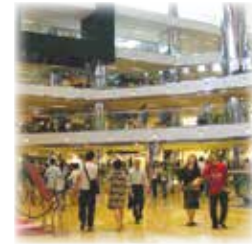
a shopping centre